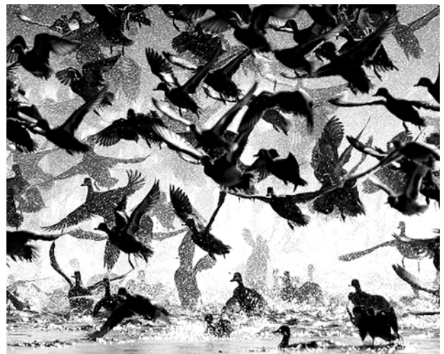
A large flock of Blue-winged Teal take flight during the Dec. 8, 2007 Viera Wetlands field trip.

Details for each month's field trips will be posted in the Peligram in advance. For more information, please call 772-567-3520 or visit www.pelicanislandaudubon.org